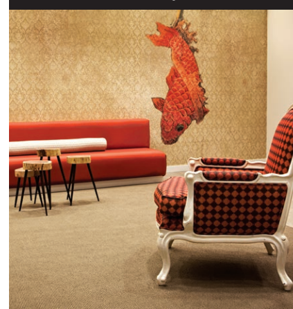
View 14's common area is setting a whole new bar.

What's your MO? We've taken the best tricks of the trade for creating a chic sofa or chair that can also survive all the joy and chaos of having a family. What's your favorite material? There's a really cool vinyl. It's called Smooth Operator, and it's got an ostrich-style print on it. What's your hottest piece? The Empire Strikes Back chair—everybody loves that chair. Putting a pop of color on that really gets people excited.